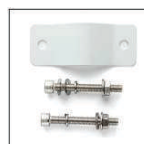
Mount on wall or pole