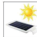
Charge directly under the sun