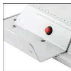
Press switch once to turn on