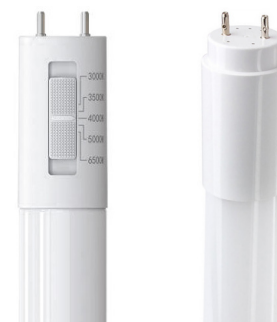
S11766 Color Selectable